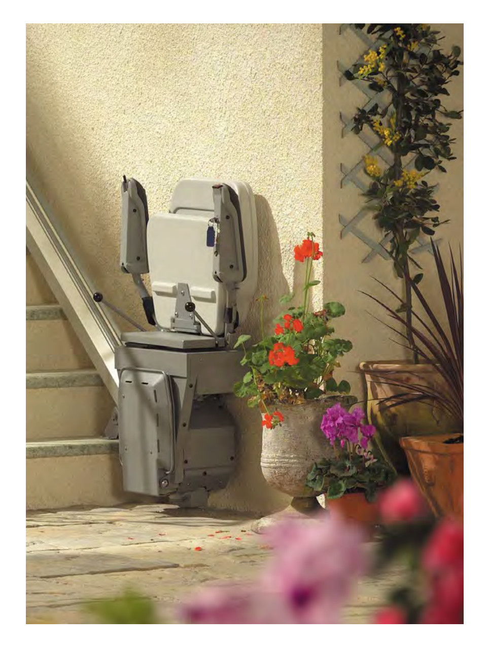
The Outdoor's slimline design allows others to still use the stairs

Fitted to the stairs and not to the wall, the Outdoor straight rail can only be fitted to solid concrete, solid wood or metal staircases.