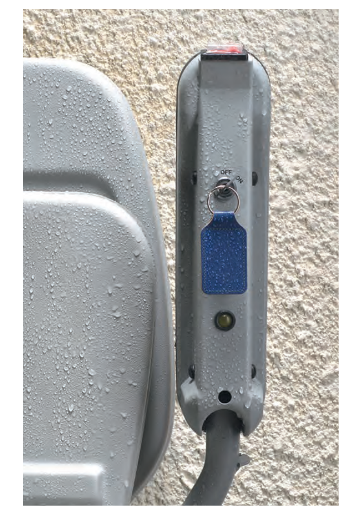
On-off light as standard for ease of use