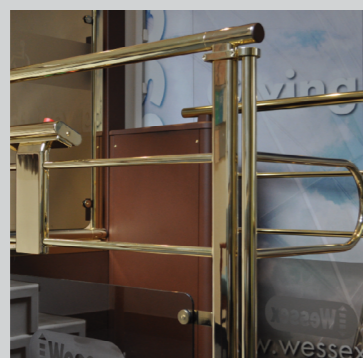
Special Colours and Finishes