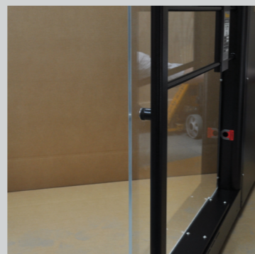
Full Height Side Panels