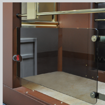
Glass Infill Panel