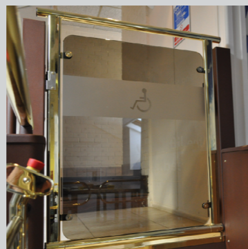
Manual / Power Gates