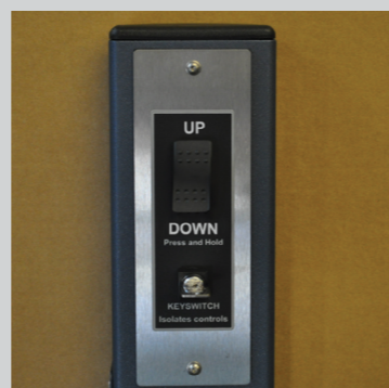
Key Switched Controls