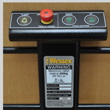
High Specification Controls