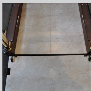
Special Floor Covering