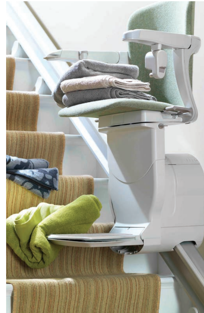
Sensors detect any obstructions on your stairs

"We are delighted with the stairlift. My wife enjoys the ride. It gives her independence. She finds it very easy to use"