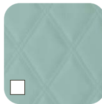
Duck Egg Blue