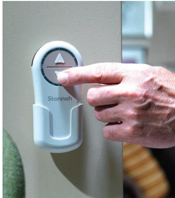
Use the wall control to call your Starla