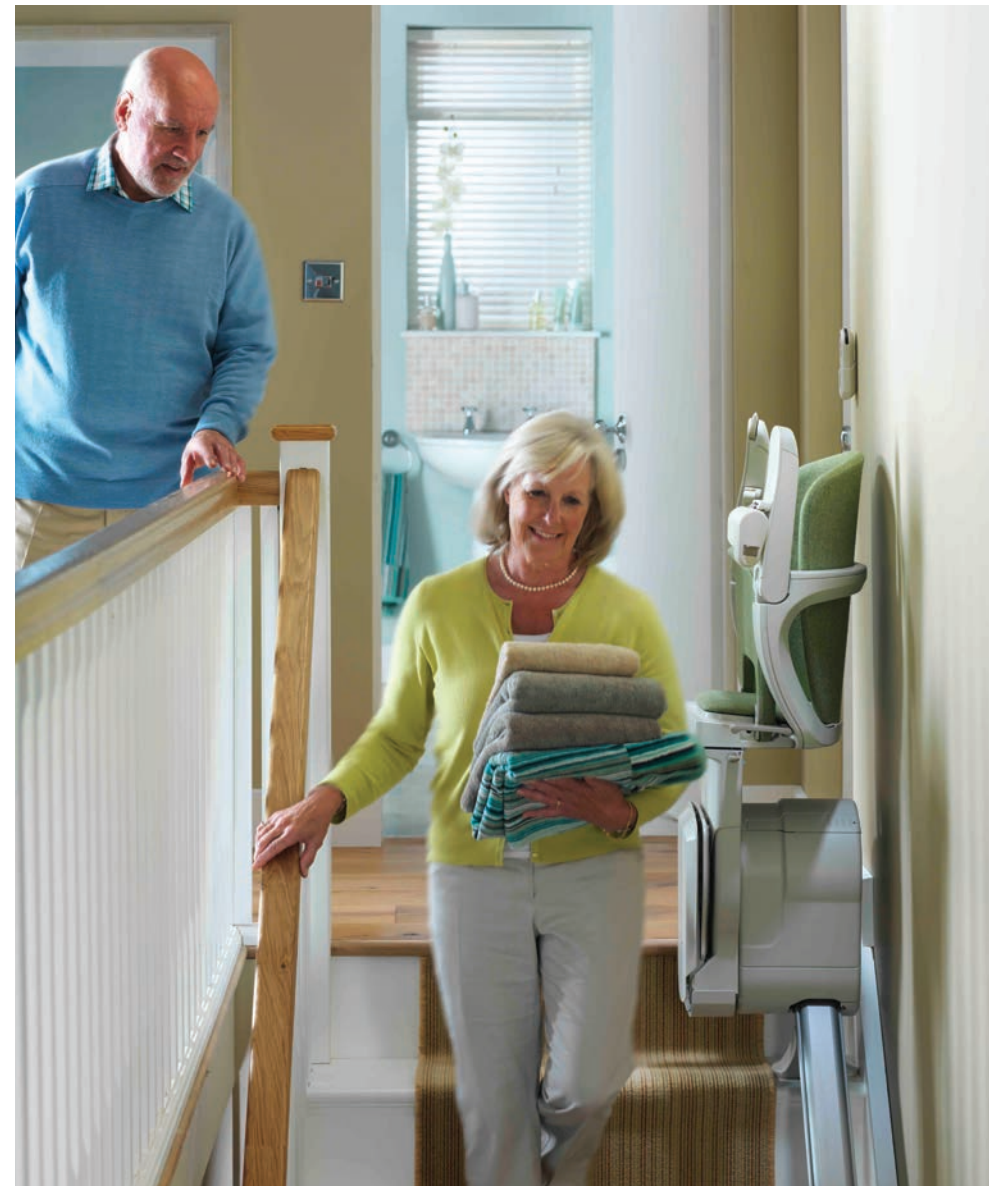
The Starla's slimline design allows others to still use the stairs

Tailor it to your tastes and home by choosing a fabric, with or without a light or dark wood finish or select the full vinyl upholstery in a range of sophisticated colours.